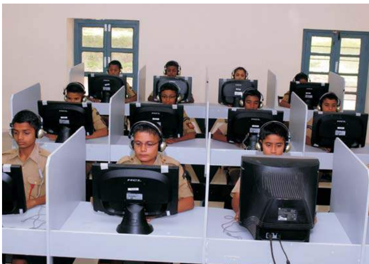
INTERNET ENABLED COMPUTER LABORATORY