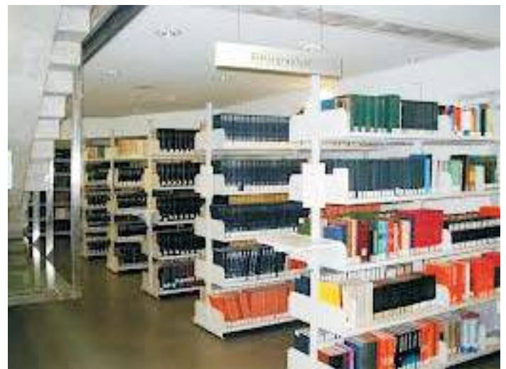
WELL STOCKED LIBRARY